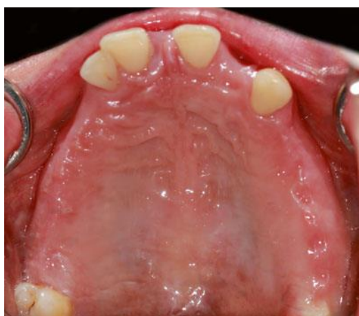
Figure 1.3: Posterior tooth loss may result in overloading of the anterior tooth.

This situation may be further exacerbated by the presence of periodontal problems (Şakar, 2016).